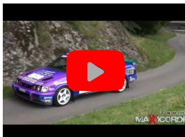
Rallye du Chablais 2022 MaXicorde P...