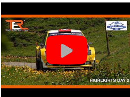
TER - Tour European Rally 2022 Round 2 [TER Series]