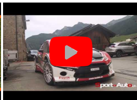
Rallye du Chablais 2022 - Le Clip d...