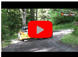
Rallye du Chablais 2022 [Rallye-Start]