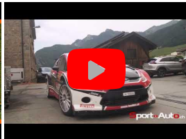
Rallye du Chablais 2022 - Le Clip d... [Sport-Auto.ch]