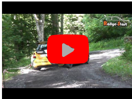
Rallye du Chablais 2022 [Rallye-Start]