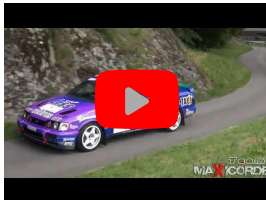
Rallye du Chablais 2022 MaXicorde P...