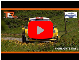
TER - Tour European Rally 2022 Round 2 [TER Series]