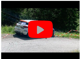
Highlights Rallye du Chablais 2022 [yann42 rallye]