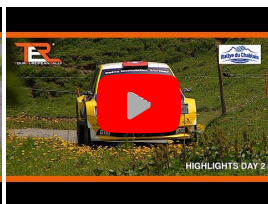
TER - Tour European Rally 2022 Roun... [TER Series]