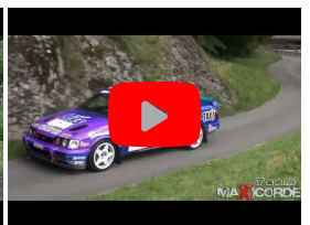
Rallye du Chablais 2022 MaXicorde P...