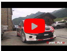
Rallye du Chablais 2022 - Le Clip d... [Sport-Auto.ch]