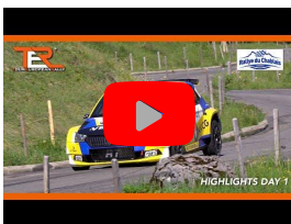
TER - Tour European Rally 2022 Roun... [TER Series]