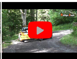
Rallye du Chablais 2022 [Rallye-Start]